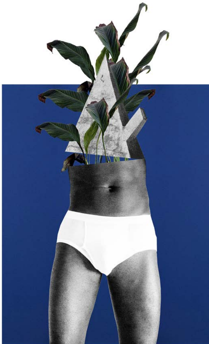
Kadara Enyeasi, Form 03, Box of Curiosities, 2013.

and assorted goodies I cannot name. Even the basket was an elaborate construction.